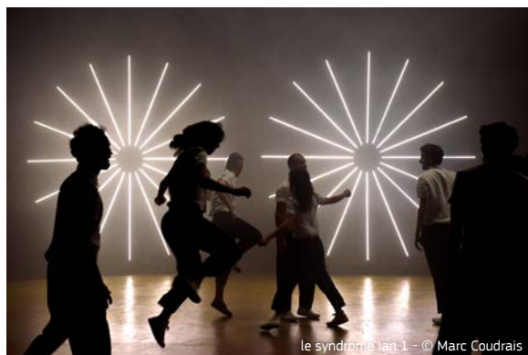
le syndrome ian 1 - © Marc Coudrais

The FEDORA Platform supports emerging artists through an international Prizes competition that gives their creative work the chance to reach the stage, increases their international visibility and contributes to their transnational mobility. The FEDORA Platform also enables them to engage with a younger and wider audience while attracting potential donors through on- and offline communication campaigns and local Roadshows.