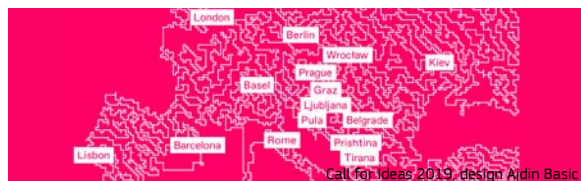
Call for Ideas 2019, design Aidin Basic