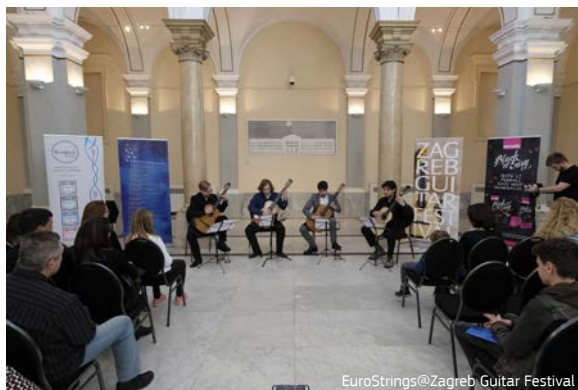
EuroStrings@Zagreb Guitar Festival

These Artists are awarded a year-long touring programme to visit Platform's Festivals following a carefully curated programme called the EuroStrings Curriculum. This programme involves work with globally acclaimed guitar players called EuroStrings Ambassadors and other industry specialists in development-gear workshops, teaching, community outreach, chamber and solo appearances. During the year-long programme, a big EuroStrings Competition is also organised, offering only one artist a chance to continue the tour globally in China and the USA. EuroStrings Artists are the staple of EuroStrings excellence and are the future of our instrument.virtual reality.