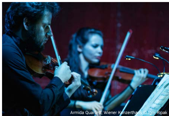
Armida Quartet, Wiener Konzerthaus

Classical Futures Europe also offers training opportunities to our supported artists to have the time and space to work on their wider professional development, exploring the artistic and social dimensions of their work with industry experts.